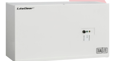
LG2 Wall Mount Surface Unit backing up Outdoor Bollards (5) 42W Compact Fluorescent Lamps