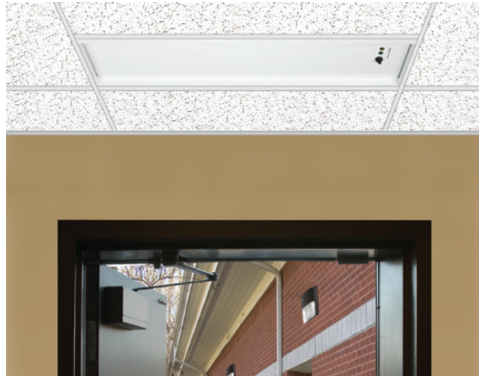
LiteGear® Recessed T-Grid Ceiling Mount Model with Outdoor Wallpacks

THE COST-EFFECTIVE, EFFICIENT, CONVENIENT WAY TO PROVIDE EMERGENCY AC POWER TO INDOOR OR OUTDOOR FIXTURES.