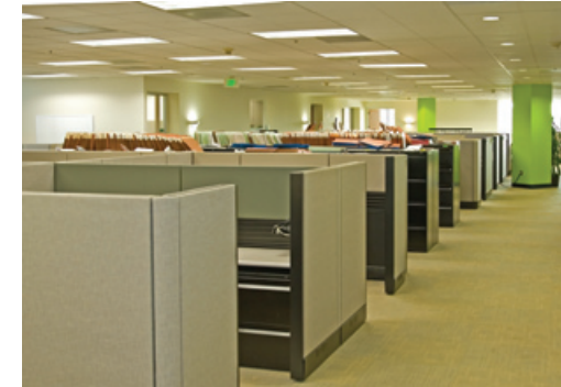
LG1T Recessed T-Grid Ceiling Unit backing up Indoor Fluorescent Fixtures (3) 32W Linear Fluorescent Lamps

Available with 100VA or 250VA capacity, Dual-Lite's LiteGear® compact central lighting inverters provide emergency AC power to existing indoor and outdoor lighting fixtures. The LiteGear® series is compatible with incandescent, compact fluorescent, linear fluorescent and LED lamped fixtures. As opposed to traditional battery packs, a LiteGear® inverter provides full light output for 90 minutes providing a brighter path of egress. In addition the LiteGear® inverter series allows for fewer fixtures to be designated as emergency fixtures and centralizes the maintenance of these fixtures to one convenient location.