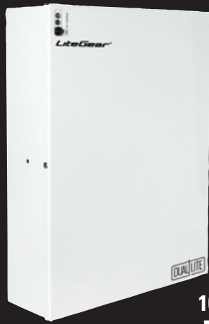
LG1S 100VA Surface Mount Model