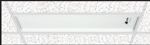
LG1T 100VA Recessed Ceiling Mount Model