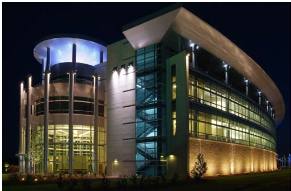
The first floor of the new Hubbell Lighting, Inc. in Greenville, South Carolina hosts an industry-leading 25,00-square foot Lighting Solutions Center (LSC). Dual-Lite inverters play a prominent role in the LSC, and also power critical building loads in case of emergency.

Dual-Lite is no stranger to preserving the environment for future generations. The ever-increasing necessity to improve energy conservation continues to inspire us to offer more energy efficient products.