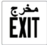
SW65 (Makhraj Arabic)

Dual-Lite's cast-aluminum SE Series exit signs feature an option for custom or standard special-wording. The images below represent a sample of standard special-worded signs available. Please review the SE Series specification sheet for a complete list of standard special-worded signs or contact the factory to request your custom special-worded sign.