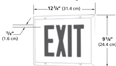
SERS or Remote Sign